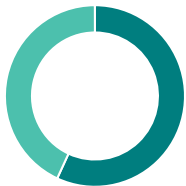
Asset allocation (%)