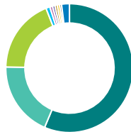
Geographic allocation (%)