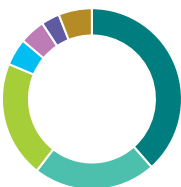
Asset allocation (%)