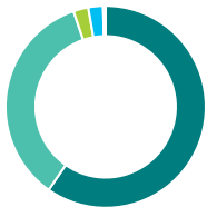
Asset allocation (%)