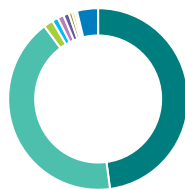
Geographic allocation (%)