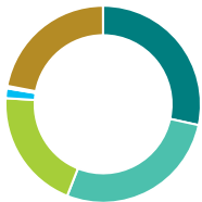
Asset allocation (%)