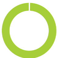
Asset allocation (%)