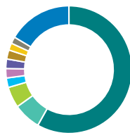
Geographic allocation (%)