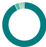
Geographic allocation (%)