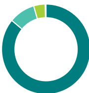
Geographic allocation (%)