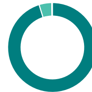
Sector allocation (%)