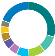
Geographic allocation (%)