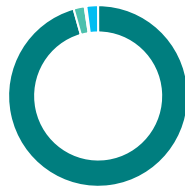
Geographic allocation (%)