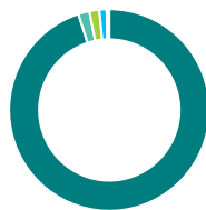
Geographic allocation (%)